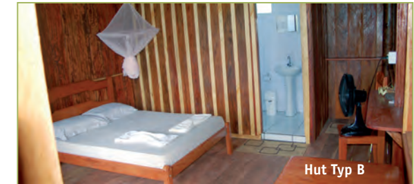
Hut Typ B

You will not find luxury at Juma Lake Inn but you will not miss it either: Here you get to know the authentic and original life of the Caboclos . Enjoy the cordial hospitality and let yourself impress by the great commitment and knowledge of the guides.