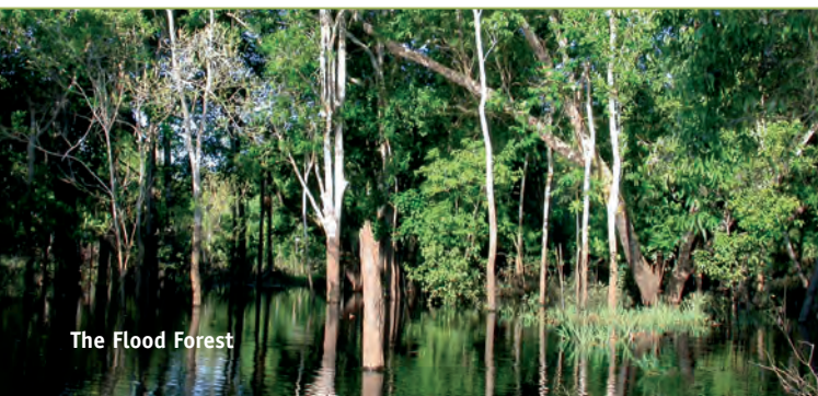
The Flood Forest

Here, a family community invites you to get to know the original and pure life close to nature in the Amazon region. It is ideal for all who want to experience typical hospitality in a pleasant atmosphere . The tasty meals , the friendly mood in a natural surrounding and the insights into everyday life of the habitants are particularly appreciated by the guests.